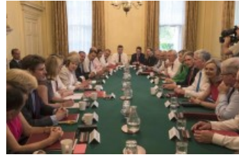
Theresa May should not have downgraded care minister's role