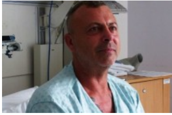
Basildon heart patient undergoes pioneering 'baked Alaska' treatment